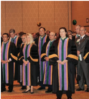
Fellow-Elects getting ready to procession into Convocation