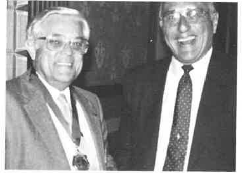
L to R: The man who got 1st prize shows it to the man who got the economy lobotomy.