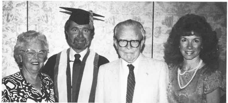
Guess whose missing camera took this shot? Call the office.