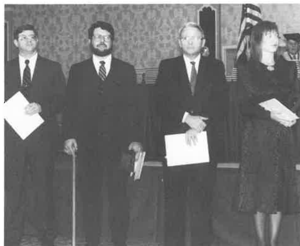
Journalism award winners.