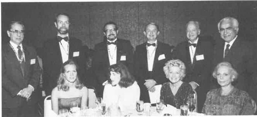
Fellows and their ladies celebrate the induction.