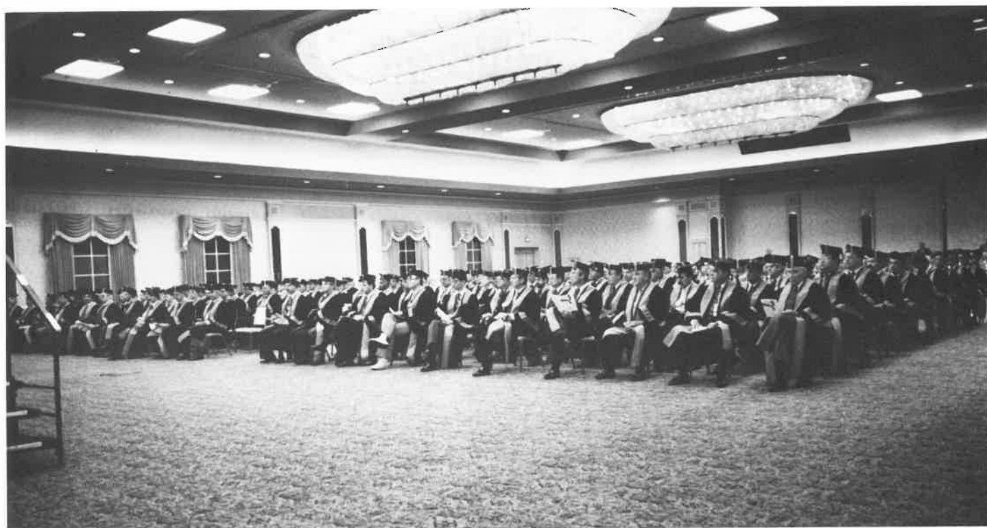
The new Fellows assembled for induction to the College.