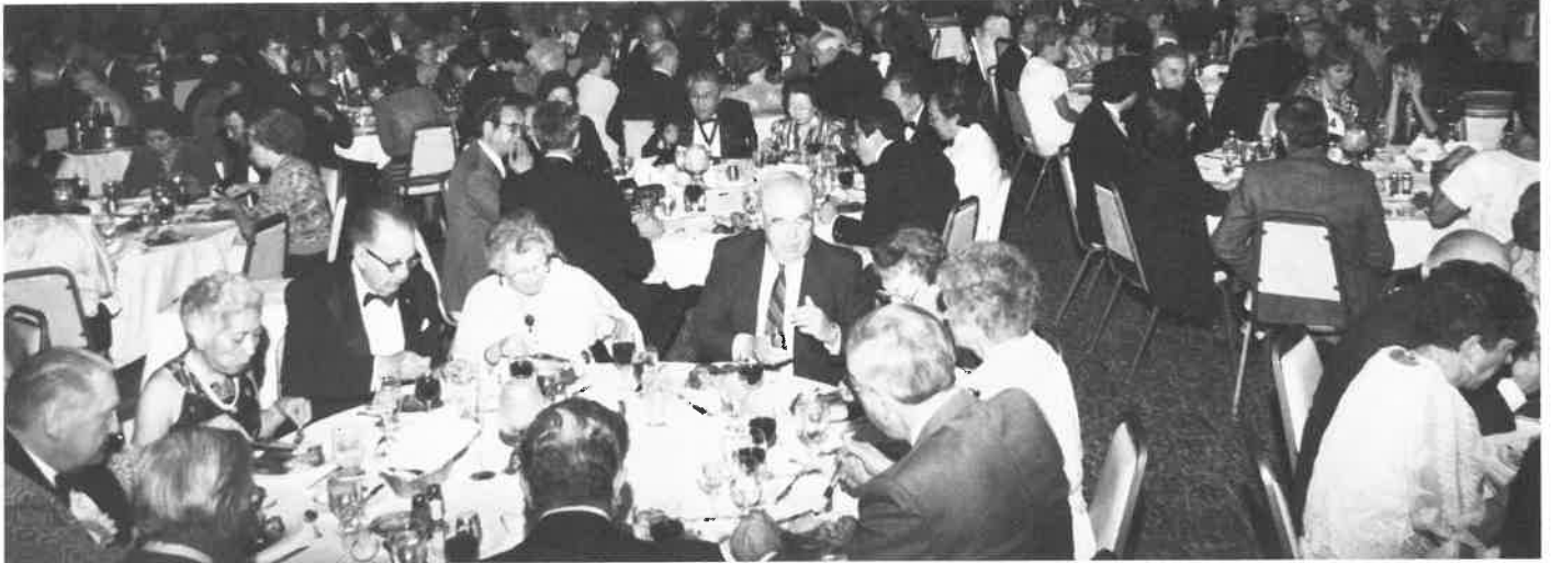
A special part of a special day.