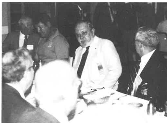
Early birds wait for 1001st way to cook chicken.