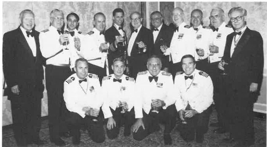
Some of the Fellows of USA District 4 toasting excellence.