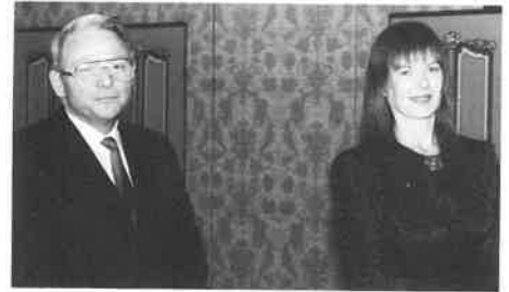
Waiting for the journalism awards. "The envelope please..."