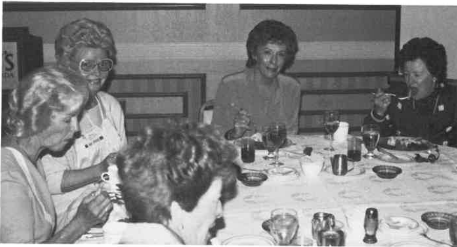
First Lady Loraine Hawkins hosts the ICD ladies.