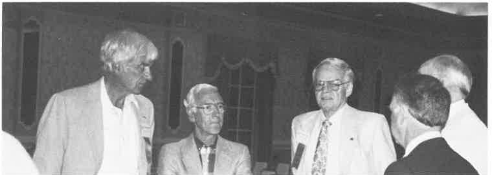
"Does he or doesn't he?"