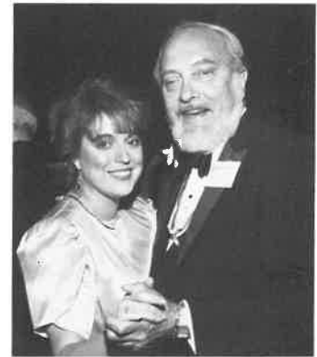
A new Fellow celebrates.