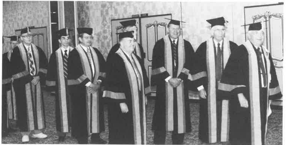
Fellows-to-be and a jogger.