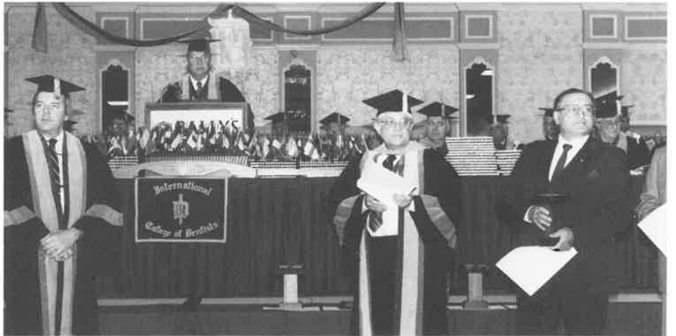
Journalism awards are interrupted by a recount.