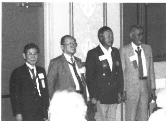
Any time four guys get together you've got a barbershop quartet.