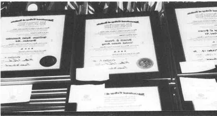
The Fellowship plaques ready for presentation to the new Fellows.