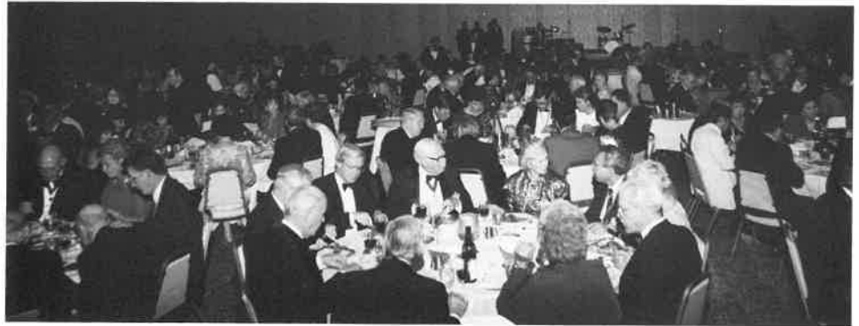
How many people does a bottle of wine serve?