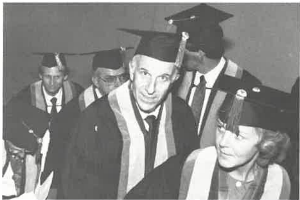
Inductees escalate to the great moment.

The younger generation faces big challenges and difficult choices to