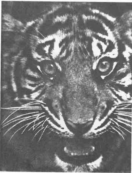
See wild animals in their natural habitat.

This 10th tuition free Continuing Education Course for ICD Fellows will be held in San Diego at the superb San Diego Marriott Hotel and Marina. This beautiful hotel in downtown San Diego Bay - a sight to behold. The sun and charm of the sea, enviable recreation, a short hop to Mexico - this is a great place for relaxed learning and exchange of ideas.