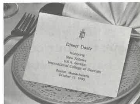
You are invited to a gala evening.

International College of Dentists Banquet Grand Ballroom The Westin Hotel Seattle, Washington Friday, October 4, 1991