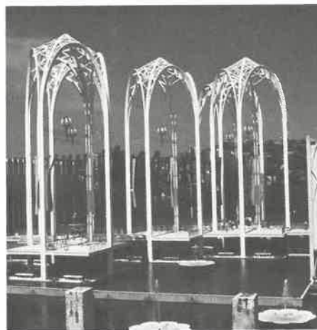
Science Center will be a real experience.

You are invited to the Convocation and Banquet October 4, 1991