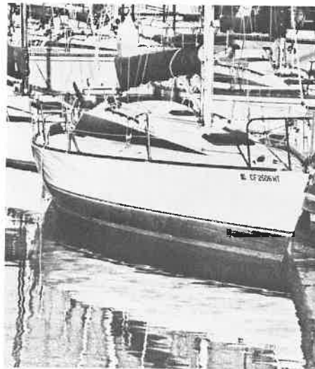
Sailboats are available to sail the Pacific.

Put on your calendars Continuing Education Conference X San Diego July 9-12, 1992