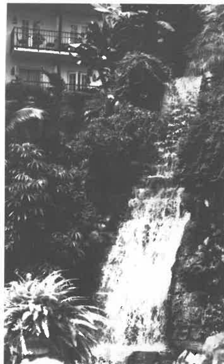
Opryland Hotel waterfall.

And then there was OPRYLAND with all its excitement, glamour, attractions and fun; Opryland U.S.A., the Grand Ole Opry; The Great American picnic and the marvelous Opryland Hotel with its unique attractions and mystique all contributing to making this weekend a memorable one for the Fellows, wives and families.