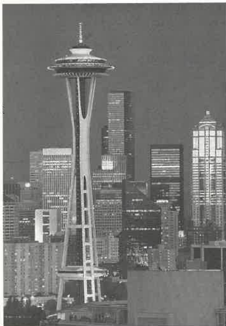
See Seattle from the fabled Space Needle.

The convocation and induction will begin at 2 p.m. Friday afternoon, October 4th in the Great Ballroom of the Westin Hotel Seattle, Washington. That evening a social hour in the Ballroom foyer will begin at 6:30 p.m. followed by the banquet at 7:30 p.m. in the Grand Ballroom