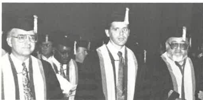
Newcomers anxiously await the ceremony.