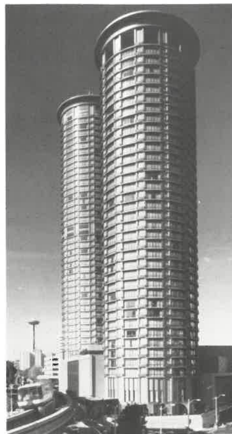
The Westin Hotel Seattle is your host site.

Entertainment and dancing to the music of the Max Pillar Orchestra will also be part of the banquet. Dress is optional but black tie is suggested.