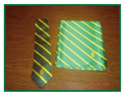
ICD Ties & Scarves