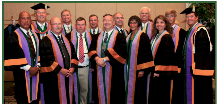
ICD Fellow-Elects in Robing Room preparing for the Convocation.