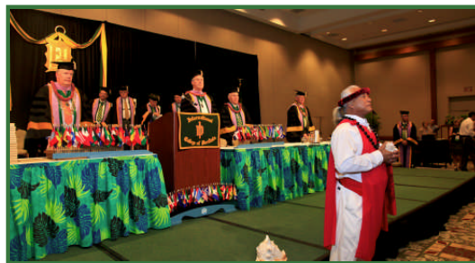
2009 Convocation Ceremony - All receiving an Hawaiian blessing.