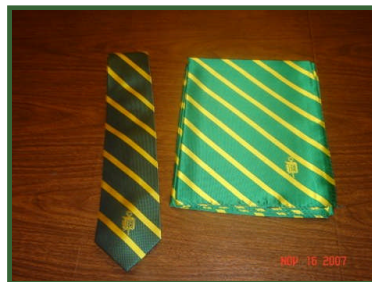
ICD Ties & Scarves