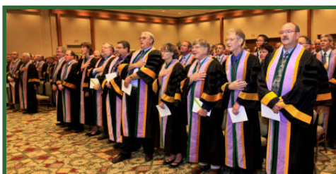
ICD Fellow-Elects during Convocation Ceremony in Honolulu, Hawaii.