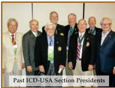
Past ICD-USA Section Presidents

SAVANNAH REGISTRATION INFO - Pages 3 & 4! ICD-USA BOR Meeting March 27-29, 2012 ACD-ICD C.E. Conference March 30-31, 2012