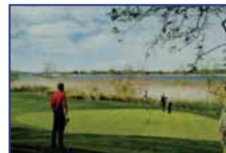
Savannah Harbor Golf Course Site of the Liberty Mutual Legends of Golf Tournament