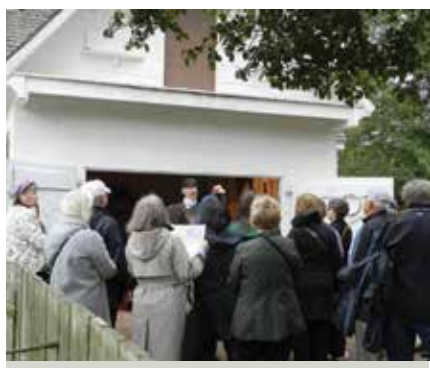
Spouse Walking Tour