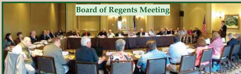
Board of Regents Meeting