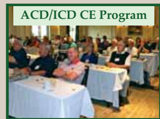
ACD/ICD CE Program